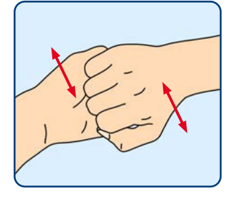
6/ Cusp backs of fingers into opposing palms and rub side to side