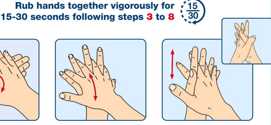
5/ Rub palm to palm with fingers interlaced, right hand over/left hand under, then swap