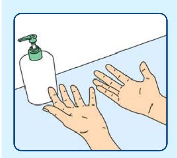
9/ Wait for hands to dry completely

10/ ONCE HANDS ARE DRY, hands are safe to undertake a task