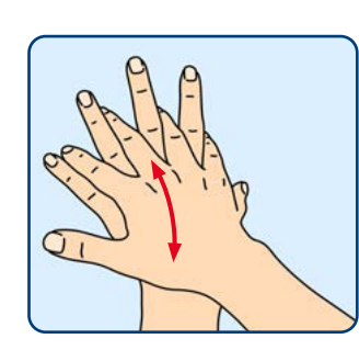
4/ Right palm on left dorsum, rub together with fingers interlaced, repeat with left palm on right dorsum